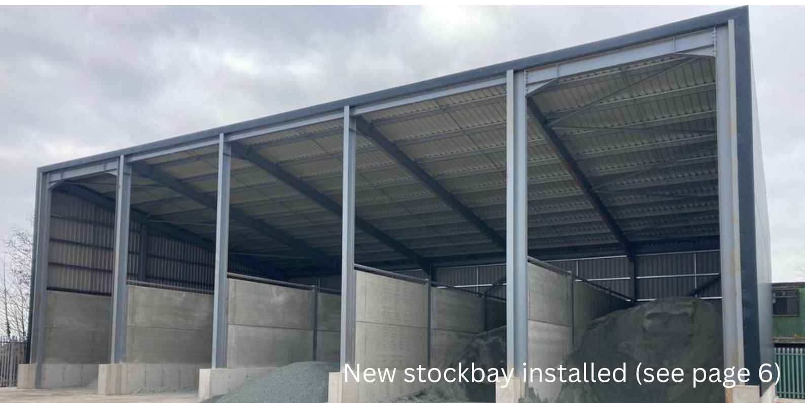
New stockbay installed (see page 6)