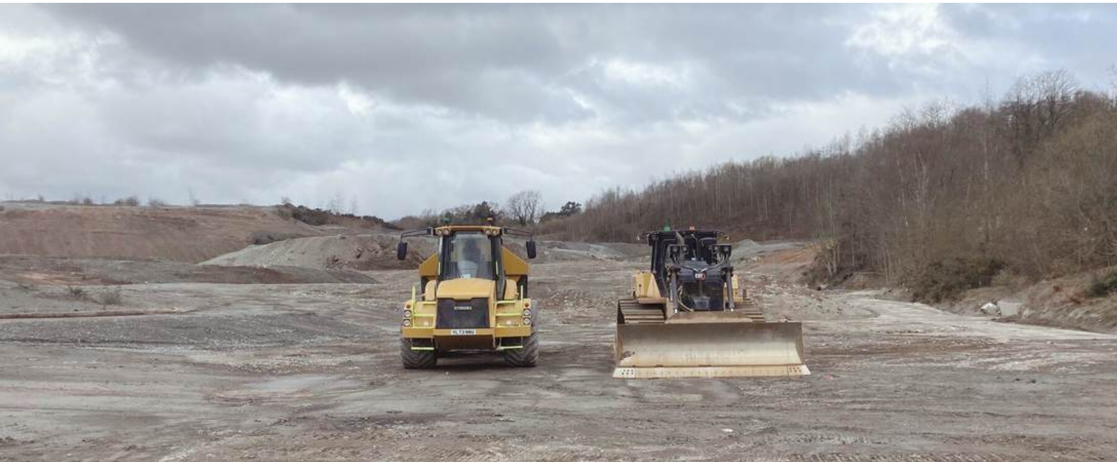
Completed demolition and clearance of entire quarry plant at Mancetter Quarry, Warwickshire