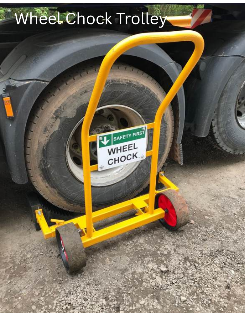
Wheel Chock Trolley