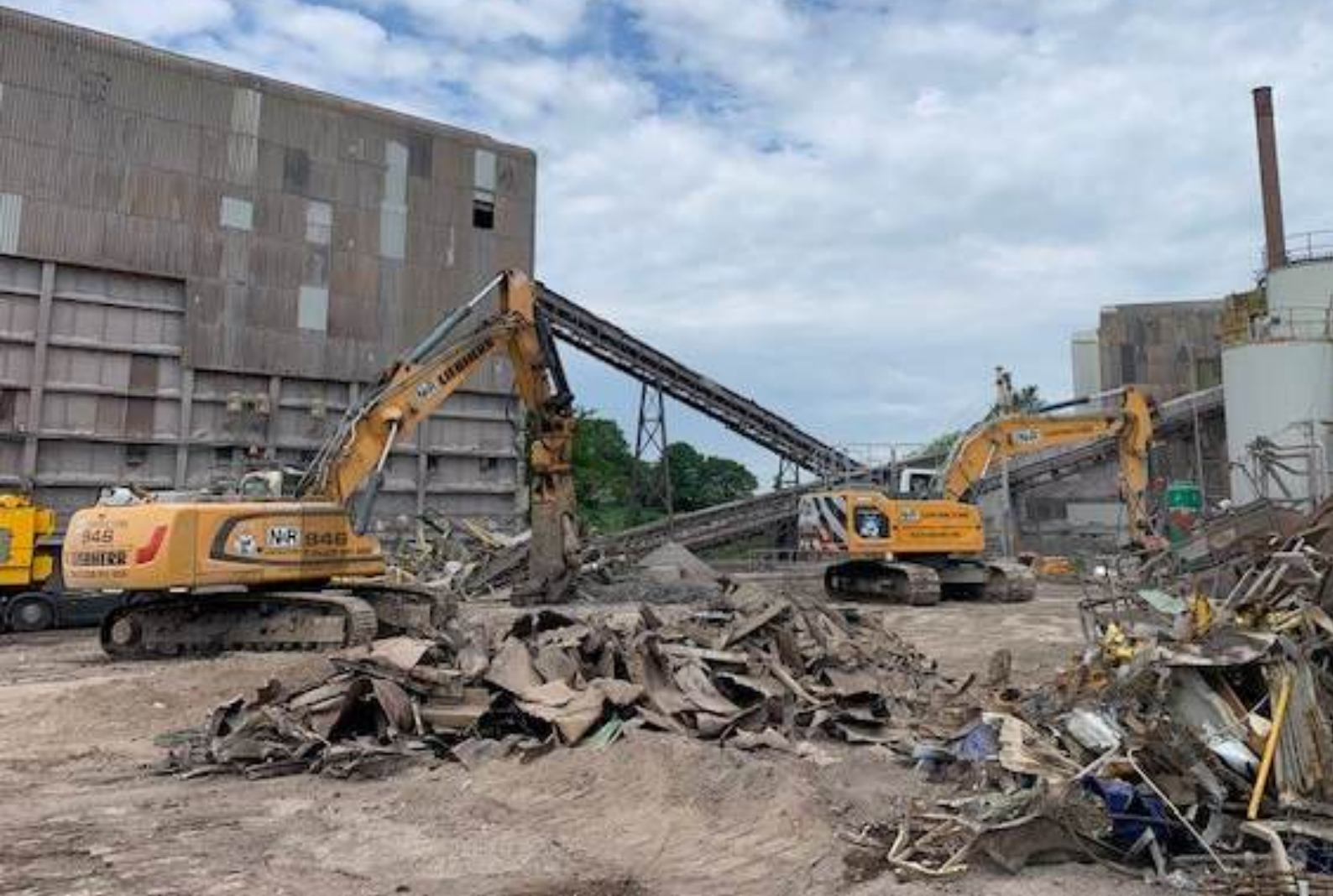
Concrete plant demolished and site cleared, Scotland