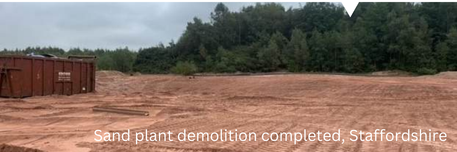
Sand plant demolition completed, Staffordshire