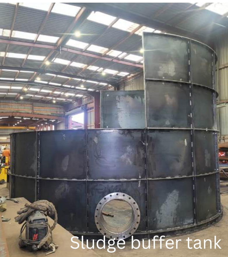
Sludge buffer tank