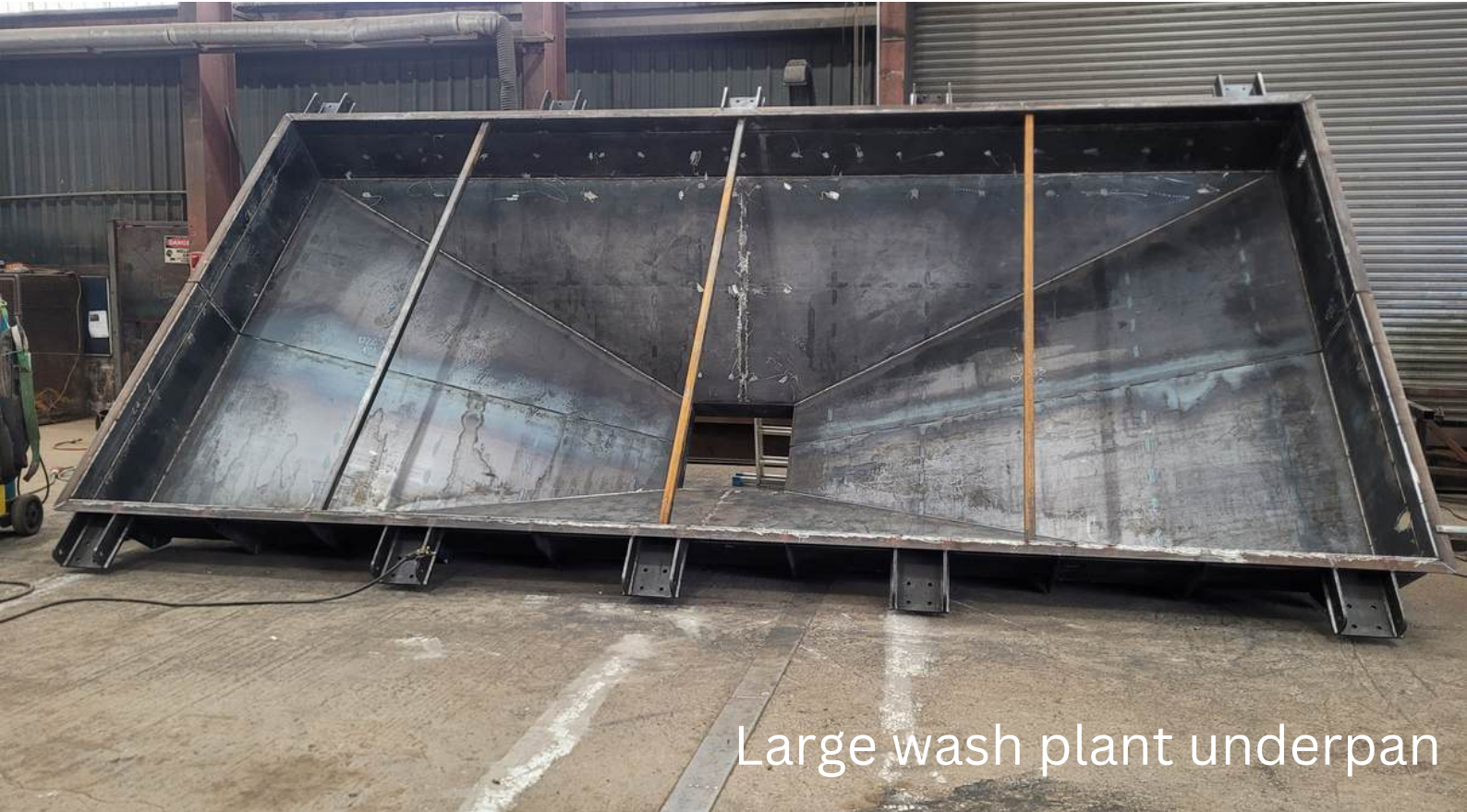
Large wash plant underpan

The workshop continues to perform well, producing high quality work for our customers across the UK. Pictured below are some examples: