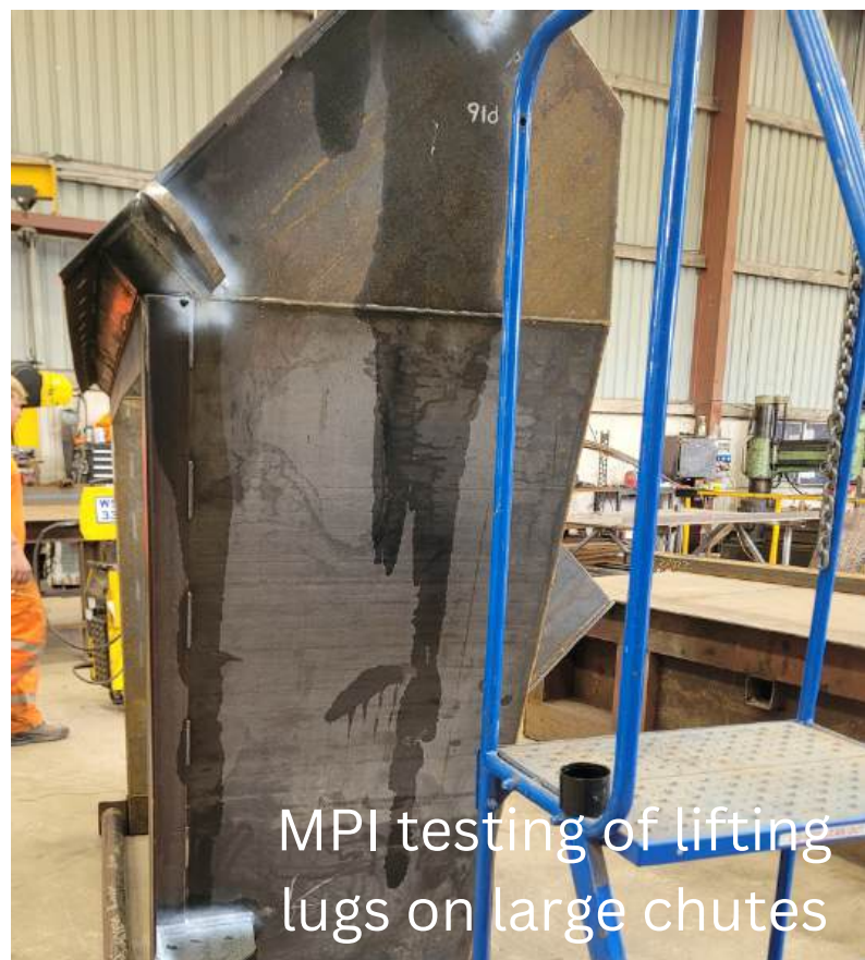
MPI testing of lifting lugs on large chutes